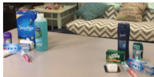
Hygiene products for students at Shelby County Schools

Through a $90,000 grant from UnitedHealthcare's Empowering Health initiative, the Shelby County Education Foundation and UnitedHealthcare are helping to address this issue by providing full-size hygiene and personal care products to the students at Kate Bond Middle School. On August 16, both organizations dropped off shampoo, deodorant, soap, toothbrushes, toothpaste, dental floss and feminine hygiene products for the students. School nurses, staff and administrators will help identify children in need and distribute the hygiene supplies accordingly.